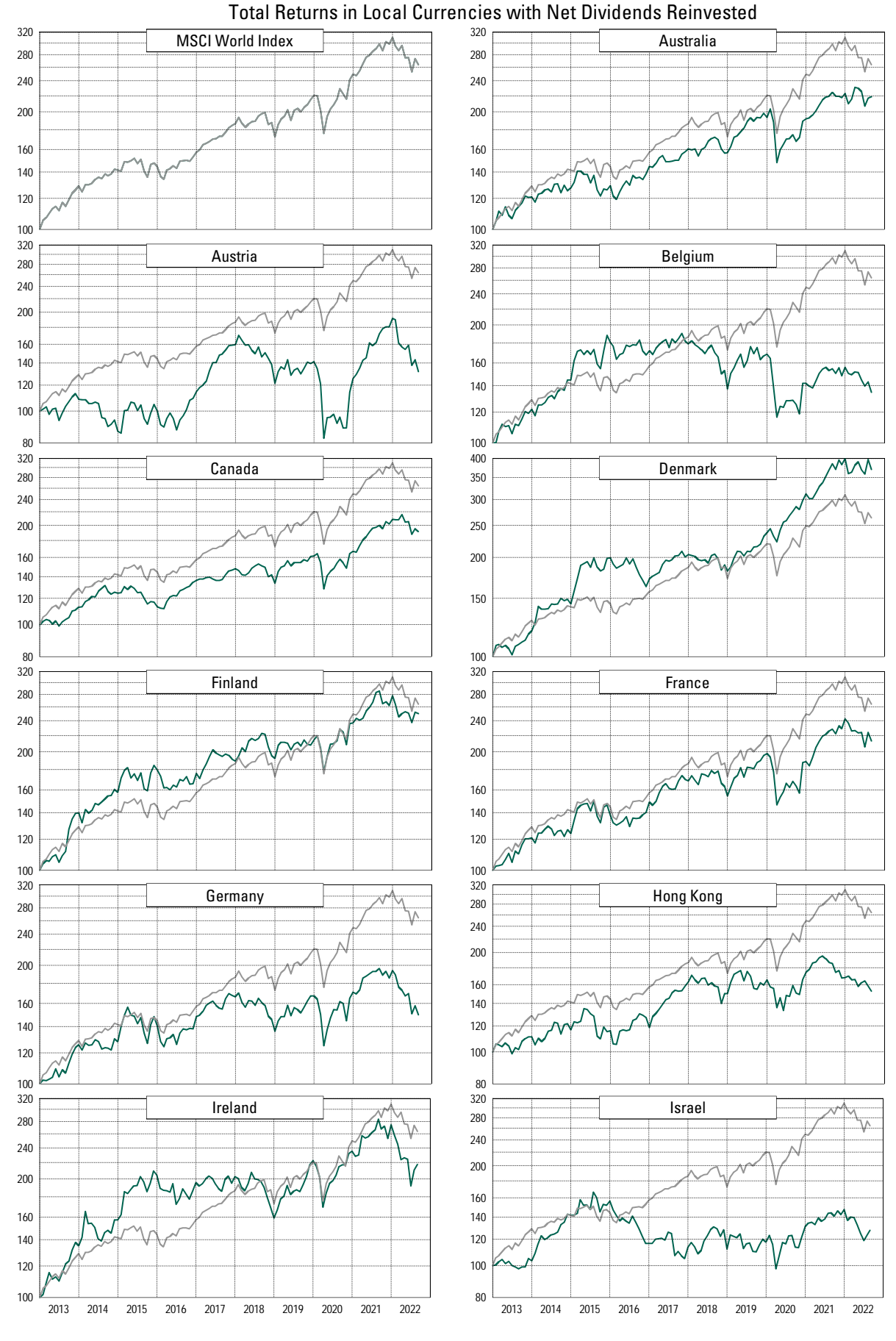
MSCI National Markets vs. MSCI World Index

December 31, 2012 = 100 Updated Through: August 31, 2022